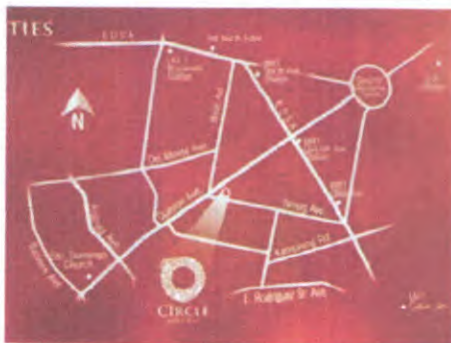
_Location Map.jpg 60K